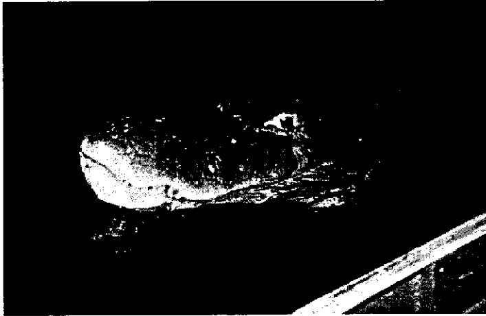
Male Melanosuchus niger 3.85 m.