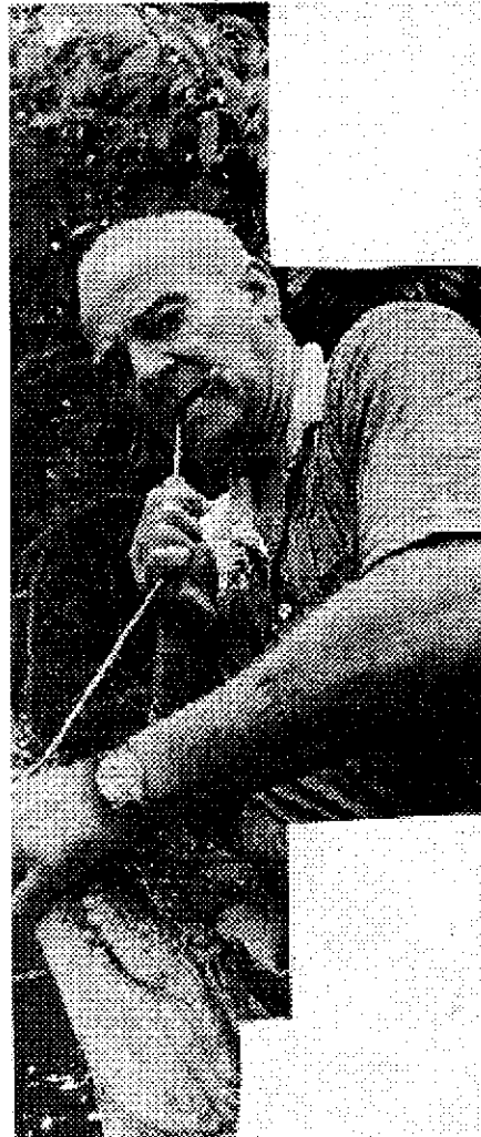
from Singapore Air SILVER KRIS Magazine, May 1997

EDITORIAL POLICY - The newsletter must contain interesting and timely information. All news on crocodylian conservation, research, management, captive propagation, trade, laws and regulations is welcome. Photographs and other graphic materials are particularly welcome. Information is usually published, as submitted, over the author's name and mailing address. The editors also extract material from correspondence or other sources and these items are attributed to the source. The information in the newsletter should be accurate, but time constraints prevent independent verification of every item. If inaccuracies do appear, please call them to the attention of the editors so that corrections can be published in later issues. The opinions expressed herein are those of the individuals identified and, unless specifically indicated as such, are not the opinions of the CSG, the SSC, or the IUCN-World Conservation Union.