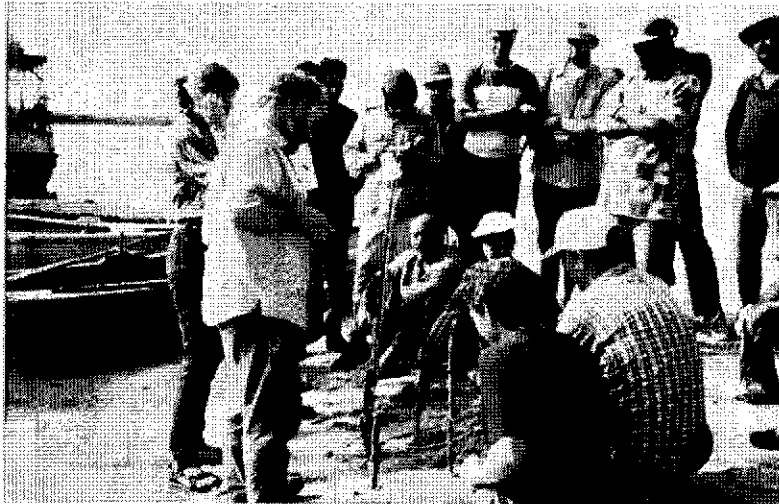
Workshop participants ponder the intricacies of crocodile traps.

in the area; another similar workshop in the near future, and the possibility of approving the biological station "Don Miguel Alvarez del Toro", the Monte Cabaniguan Refuge and its notable population of crocodiles for the realization of joint projects for research and implementation at the regional level on C. acutus in wild conditions.