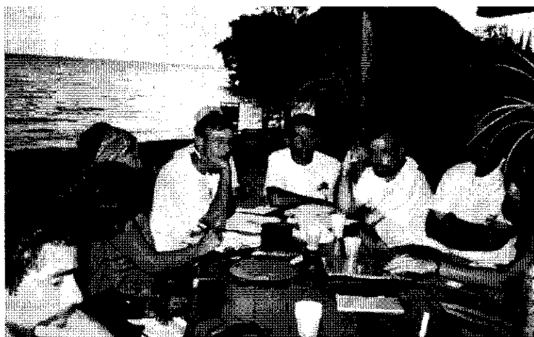
Workshop discussion, Monte Cabaniguan refuge, Cuba.

FIRST INTERNATIONAL WORKSHOP ON CROCODYLUS ACUTUS . Sponsored by the National Unit for Flora and Fauna Conservation (Ministry of Agriculture) and the Agency for Ecotourism (ECOTUR) a workshop was held 10-16 June which brought together 24 crocodile specialists from Cuba, United States, Jamaica, Mexico, Peru and the